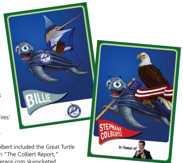
RIGHT: The turtle known as Billie, sponsored by Offfield Center for Billfish Studies, took first place on Day 11 of the Great Turtle Race, followed by Stephanie Colburtle and GITI Tires’ Champira in second and third places, respectively, on Day 12.