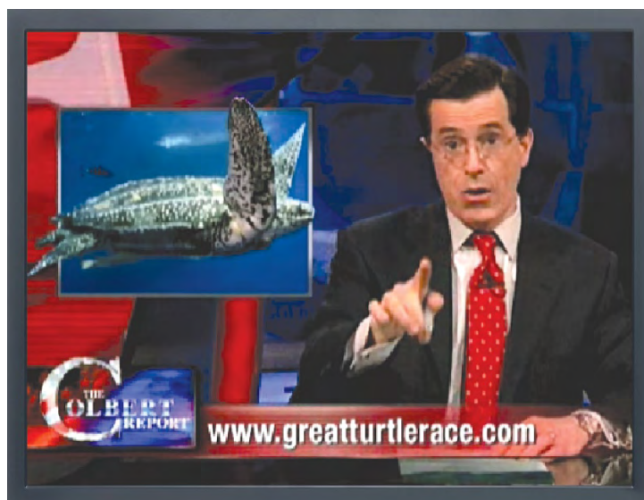
BELOW: Each time Stephen Colbert included the Great Turtle Race in his comedy sketches on “The Colbert Report,” website hits at www.greatturtlerace.com skyrocketed.