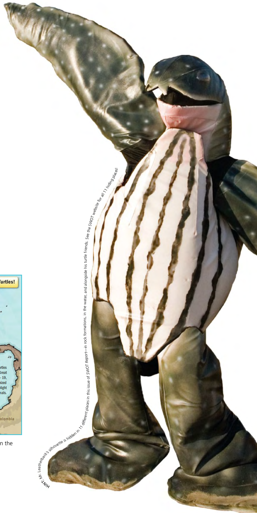
Hint: Mr. Leatherback's silhouette is hidden in 11 different places in this issue of SWOT Report—in rock formations, in the water, and alongside his turtle friends. See the SWOT website for all 11 hiding places!