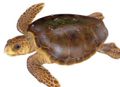
Loggerhead ( Caretta caretta ) IUCN Red List status: Vulnerable