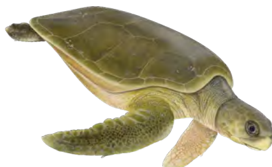
Flatback ( Natator depressus ) IUCN Red List status: Data Deficient

The seven sea turtle species that grace our oceans belong to a unique evolutionary lineage that dates back at least 110 million years. Sea turtles fall into two main subgroups: (a) the unique family Dermochelyidae , which consists of a single species, the leatherback, and (b) the family Cheloniidae , which comprises the six species of hard-shelled sea turtles.