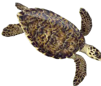
Hawksbill ( Eretmochelys imbricata ) IUCN Red List status: Critically Endangered