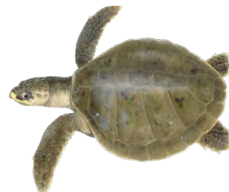
Kemp's ridley ( Lepidochelys kempii ) IUCN Red List status: Critically Endangered