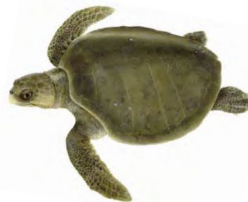
Olive ridley ( Lepidochelys olivacea ) IUCN Red List status: Vulnerable