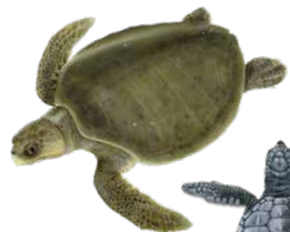
Olive ridley ( Lepidochelys olivacea ) IUCN Red List status: Vulnerable