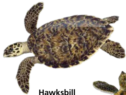
Hawksbill ( Eretmochelys imbricata ) IUCN Red List status: Critically Endangered