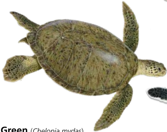
Green ( Chelonia mydas ) IUCN Red List status: Endangered