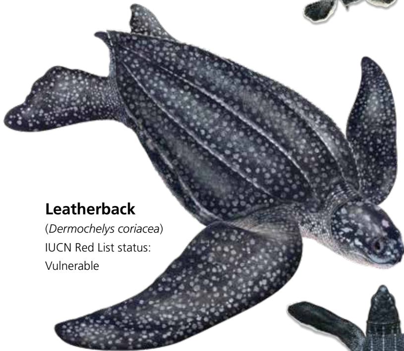
Leatherback ( Dermochelys coriacea ) IUCN Red List status: Vulnerable