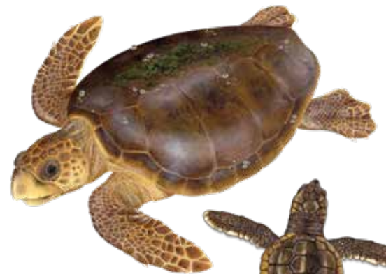
Loggerhead ( Caretta caretta ) IUCN Red List status: Vulnerable