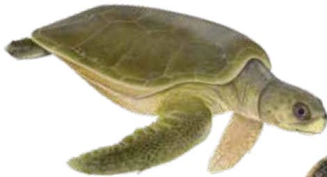
Flatback ( Natator depressus ) IUCN Red List status: Data Deficient

The seven sea turtle species that grace our oceans belong to a unique evolutionary lineage that dates back at least 110 million years. Sea turtles fall into two main subgroups: (1) the unique family Dermochelyidae , which consists of a single species, the leatherback, and (2) the family Cheloniidae , which comprises the six species of hard-shelled sea turtles.